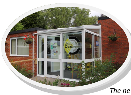
The new audiology clinic

A public consultation was held to find a new name for the centre and "Henfield Haven" was the popular choice. The Haven opened its doors to customers for the first time on 23 November 2015.