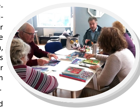
Fun activities in the café

Henfield Community Partnership put forward a proposal for a community-led solution, to open the centre for a much wider range of community uses to help people live well in later life. WSCC supported the idea, and during 18 months of negotiations agreed to give the community a 25 year lease on the building and to support it with building improvements and a start-up grant.