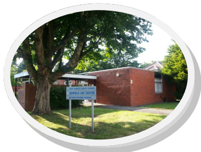
The old Day Centre